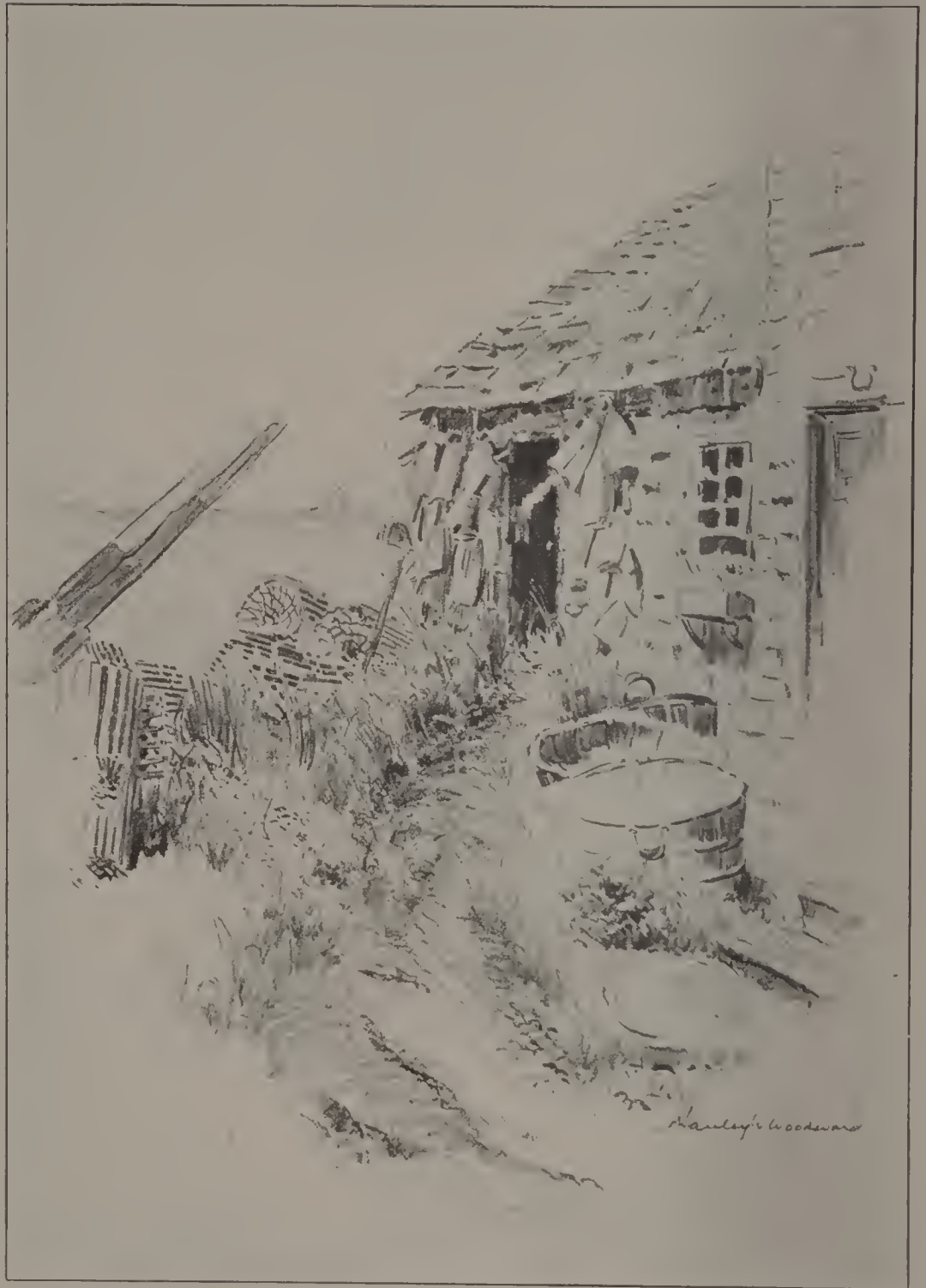
WHERE AGNES SURRIAGE MAY HAVE LIVED